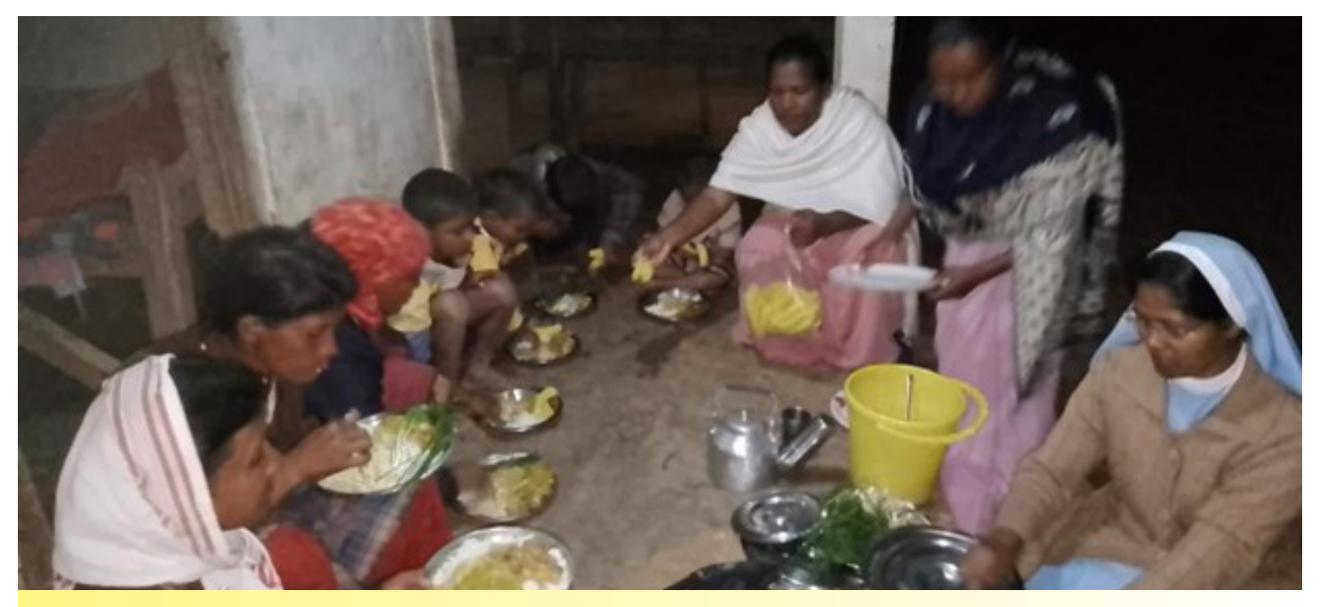
Sharing a meal with a poor family at Nongiri, Meghalaya

to 12th to create awareness and to teach them the use of the latest technology and different mobile apps. Around 80 teenagers from 3 different villages and belonging to different religions, availed of this opportunity. Along with digital teaching, the sisters offered career guidance. The teenagers were eager, interested to learn and looking for more such opportunities. The teenagers and their parents appreciated this programme and wished to have more opportunities like this.